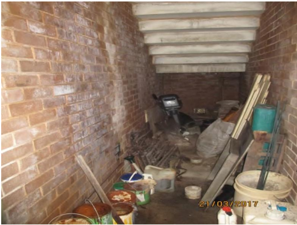
Room under stairs