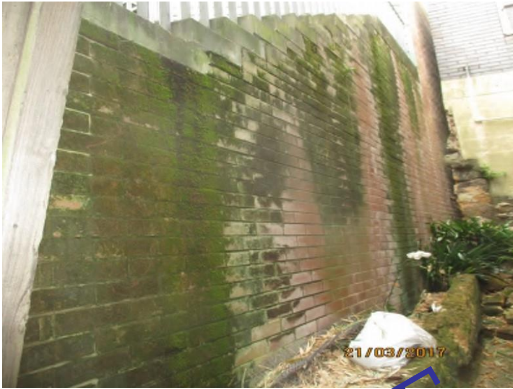
Garage and stair boundary support wall viewed from No 17