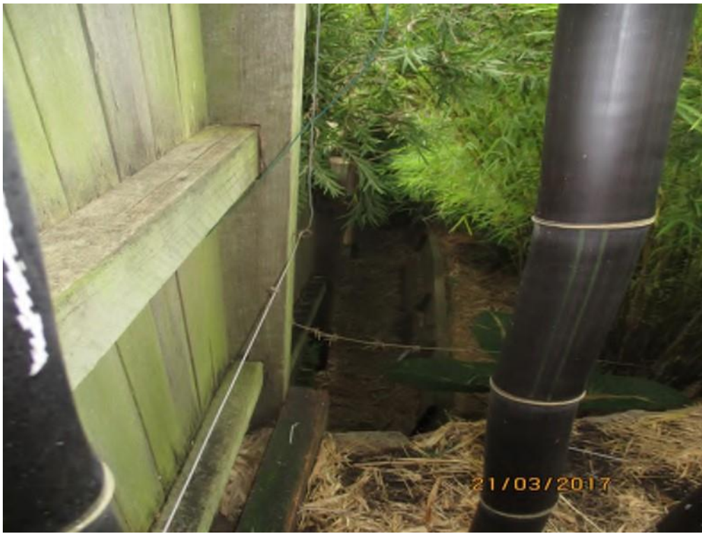
Log Retaining wall located off common boundary