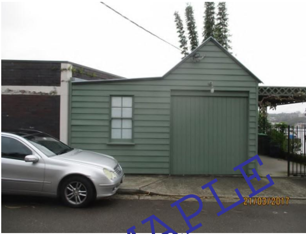
Garage Street Elevation