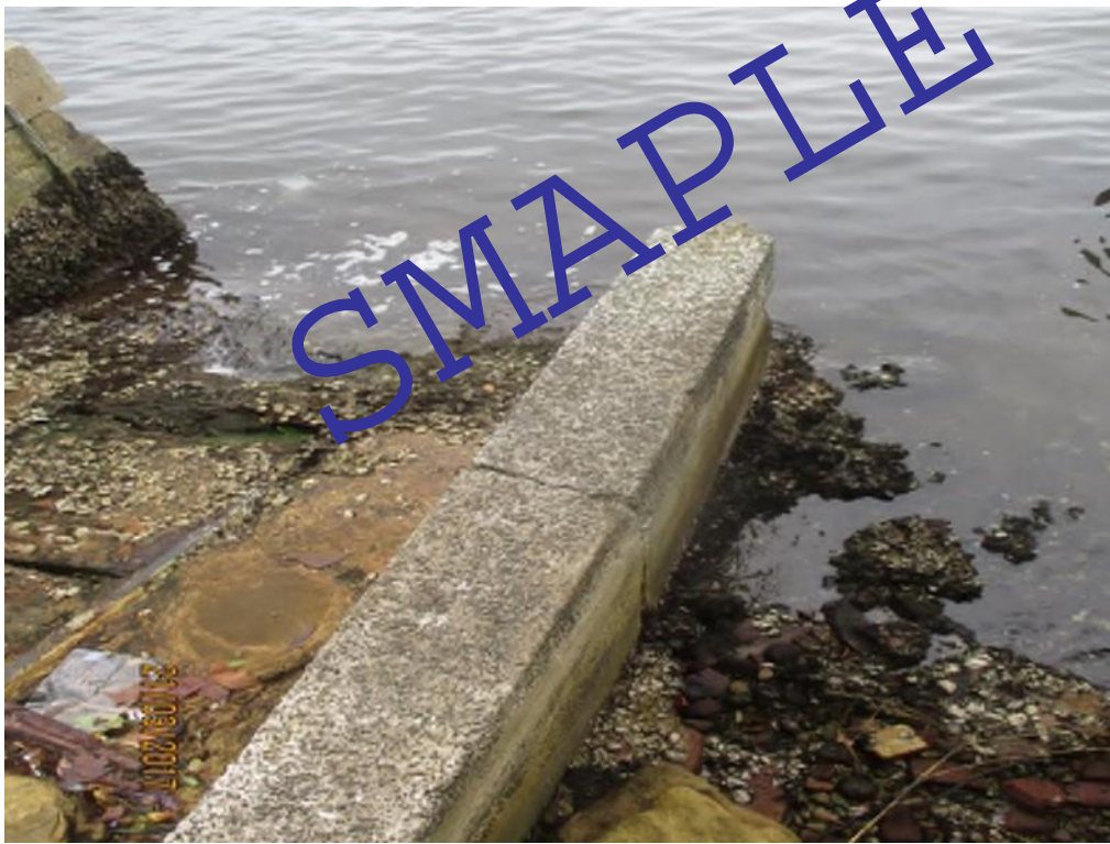
Boat Harbour -Boundary Wall