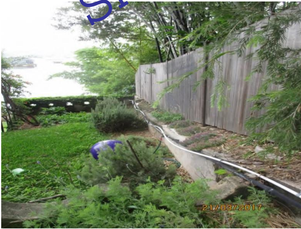
Retaining Wall supporting No 25 viewed from No 27