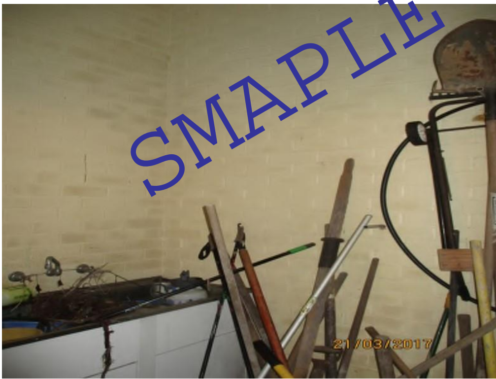
Room under garage slab