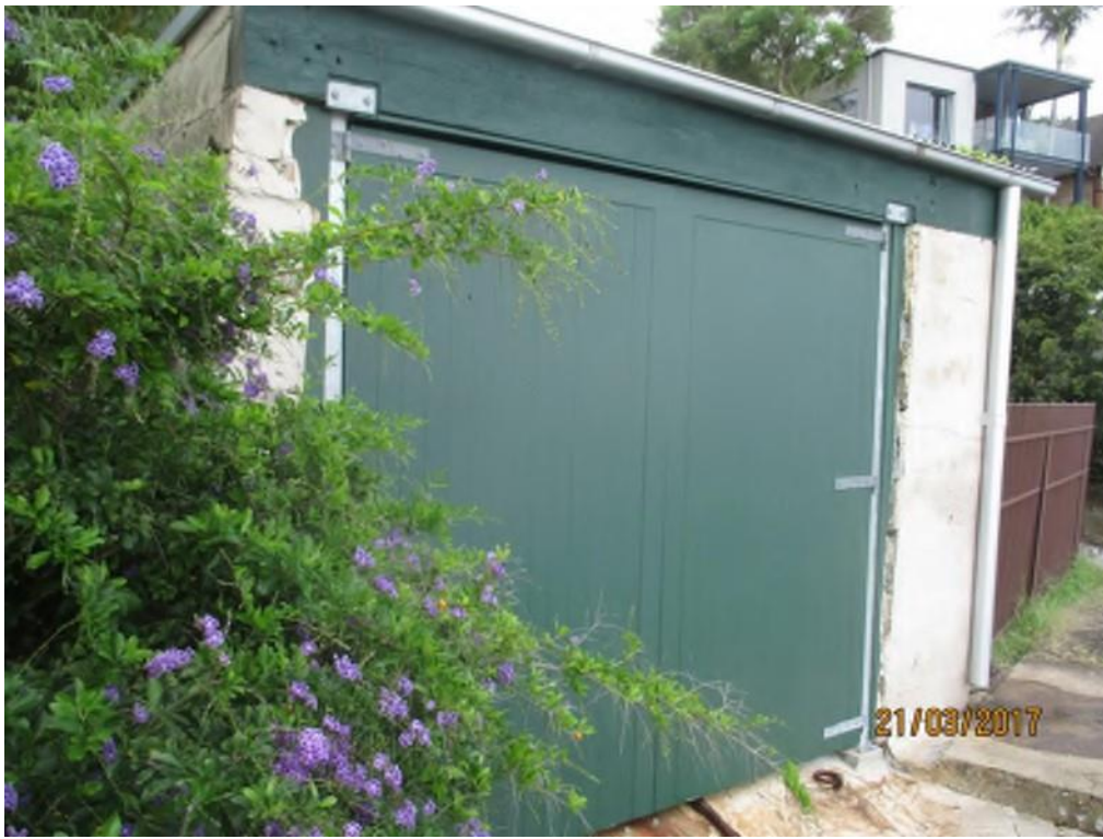
View of boat shed to No 27