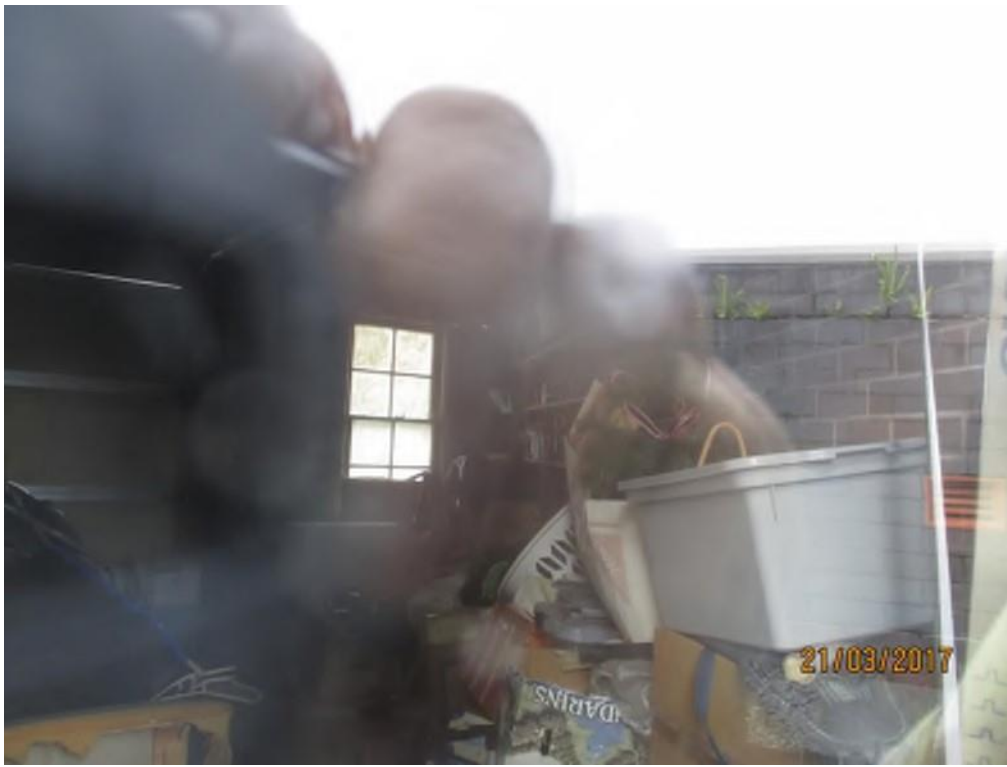
Garage interior. Garage was inaccessible