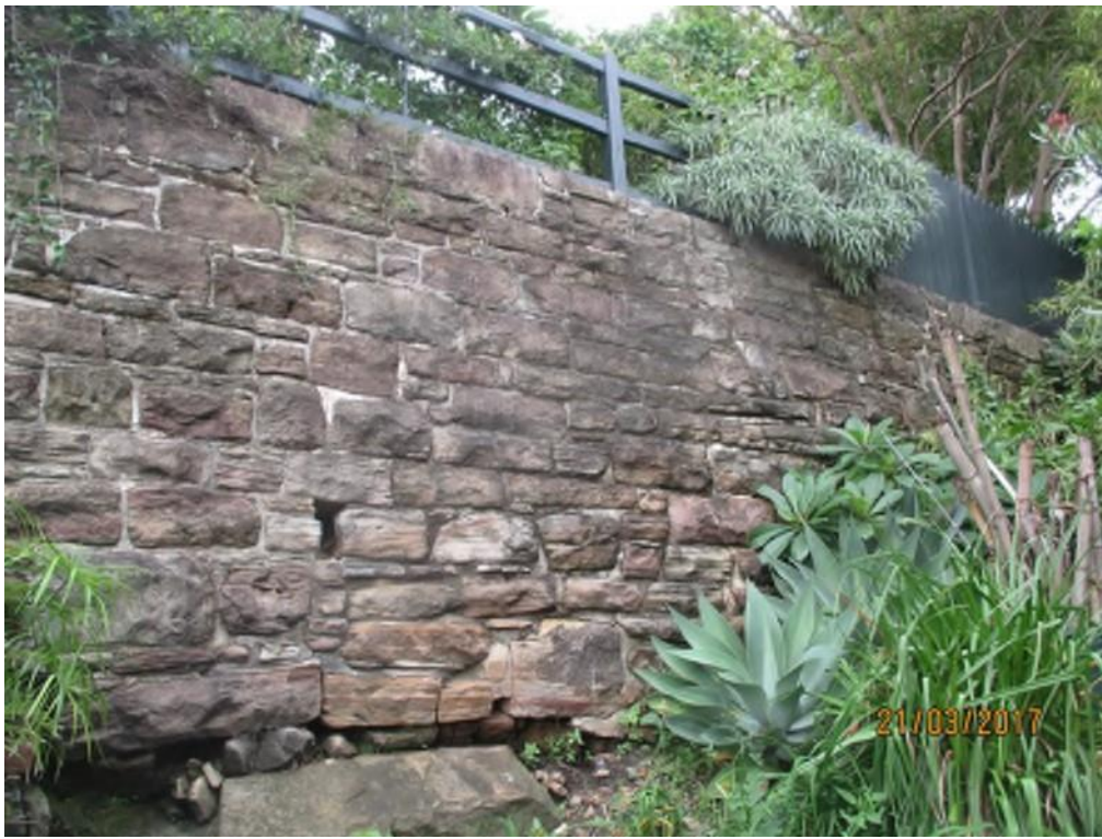
Retaining wall for tiered landscaped wall