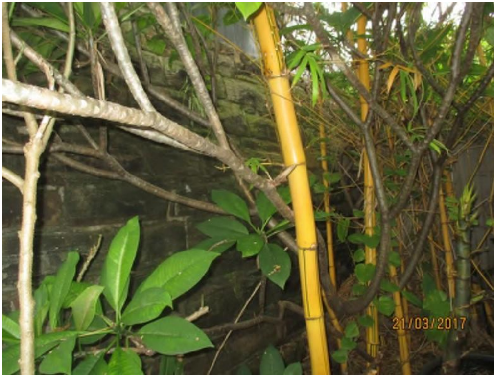
Retaining wall for tiered landscaped wall