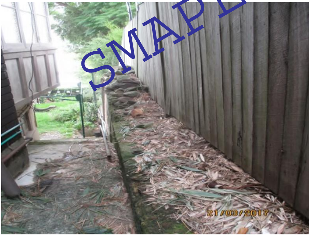
Retaining Wall supporting No 25 viewed from No 27