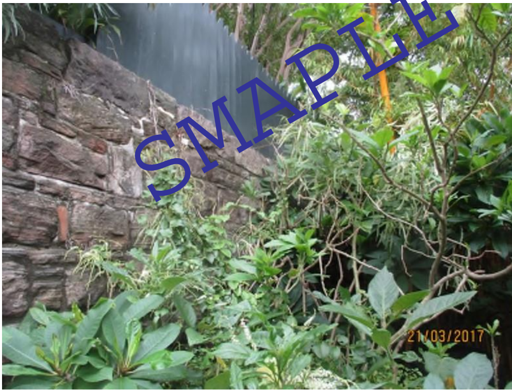
Retaining wall for tiered landscaped wall