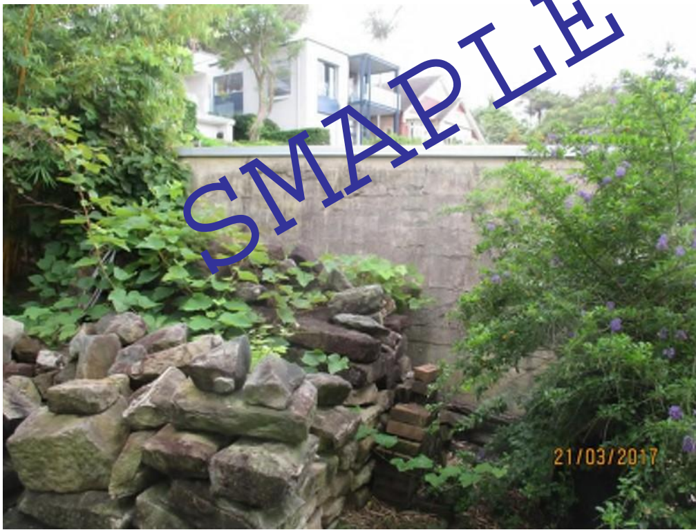
North facing yard, View of boat shed to No 27