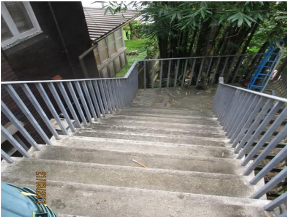
Access Stairs from upper level