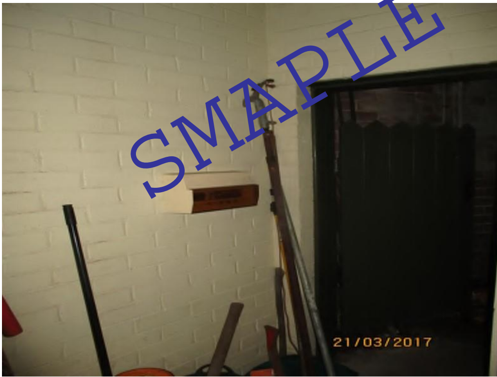
Room under stairs