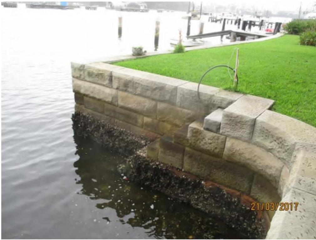
Boat harbor Wall