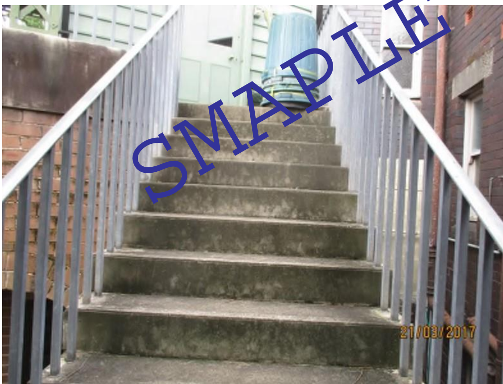
Access Stairs from mid height landing