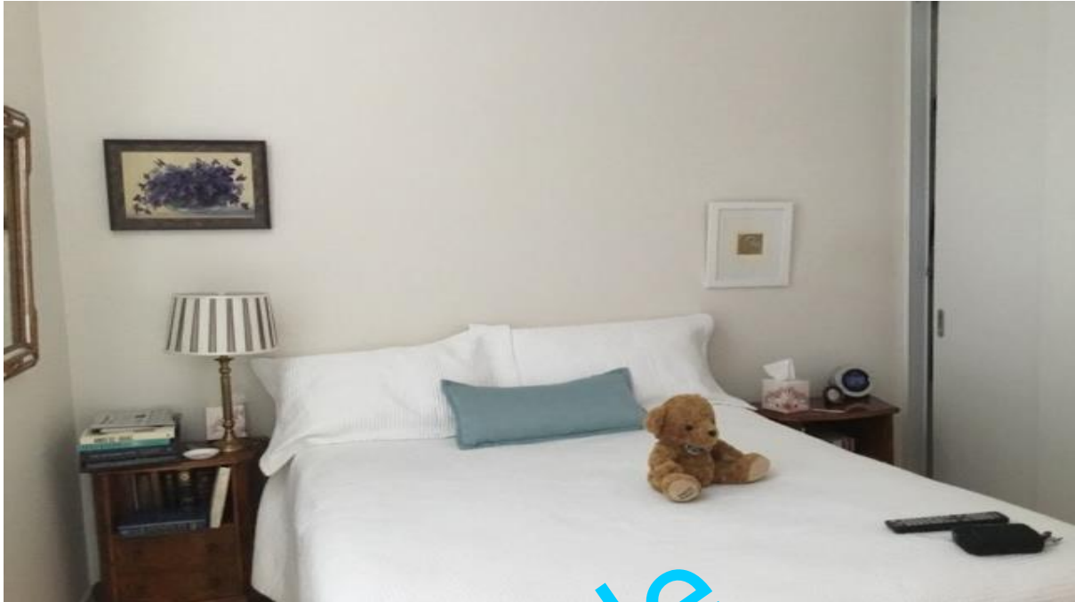
Image of the Master Bedroom

I inspected all elements within this room and I have not sighted any cracks or imperfections within the walls, floor and ceiling.