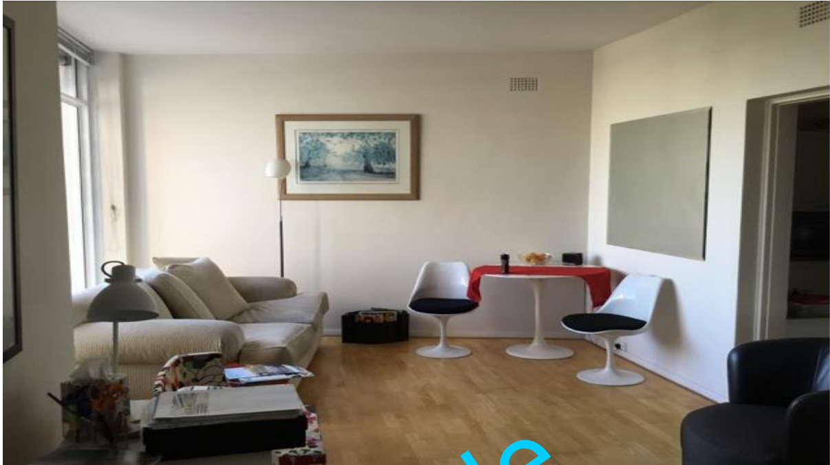
Image of the Entry Door / Hallway / Living and Dining room

The ceiling within the building is the floor of the above apartment No 24