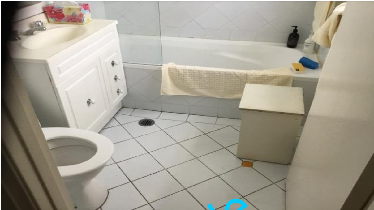
Image of the Bathroom / Ensuite

I inspected all elements within this bathroom and I have not sighted any structural cracks or imperfections within the walls, floor and ceiling.