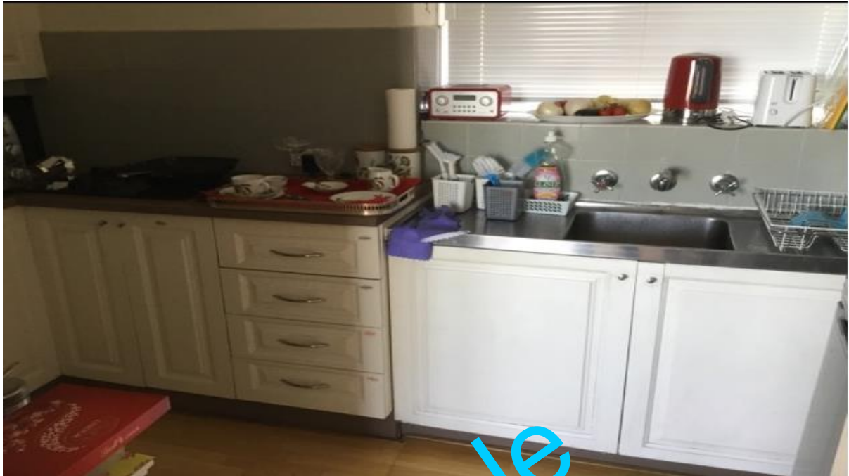
Image of the Kitchen

I inspected all elements within this room and I have not sighted any cracks or imperfections within the walls, floor and ceiling.